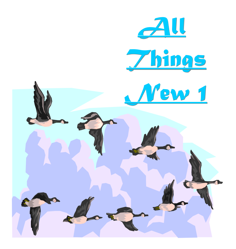
The 7 Day Story