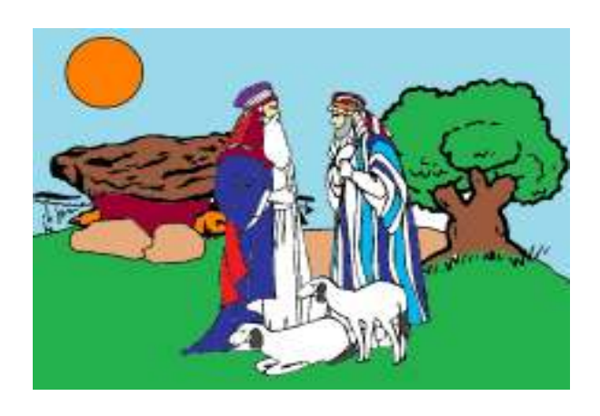
God's Rescue Plan- Abraham